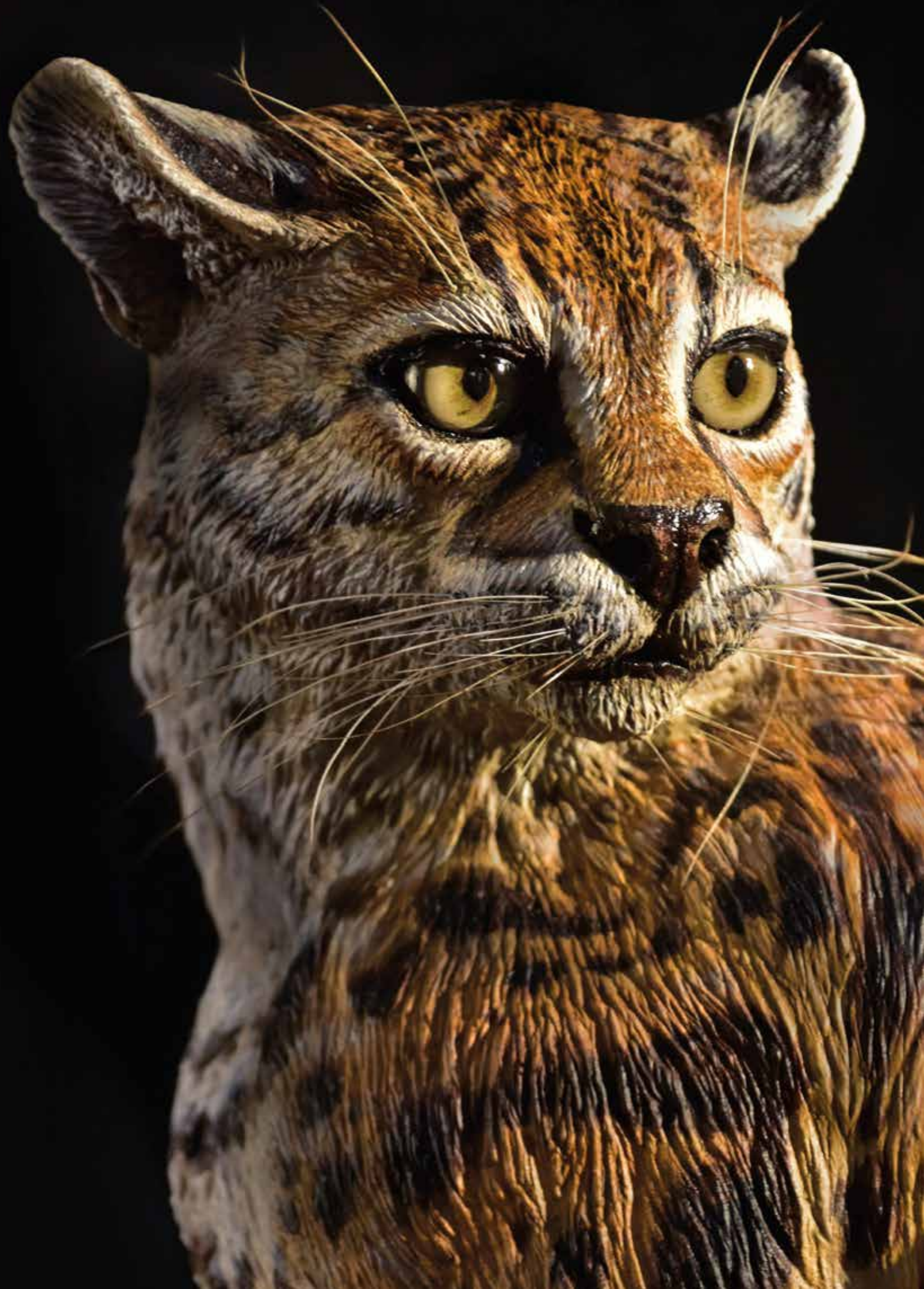
"MARGAY" Wood pulp Oil painted Limited Edition 9 h. 42 cm