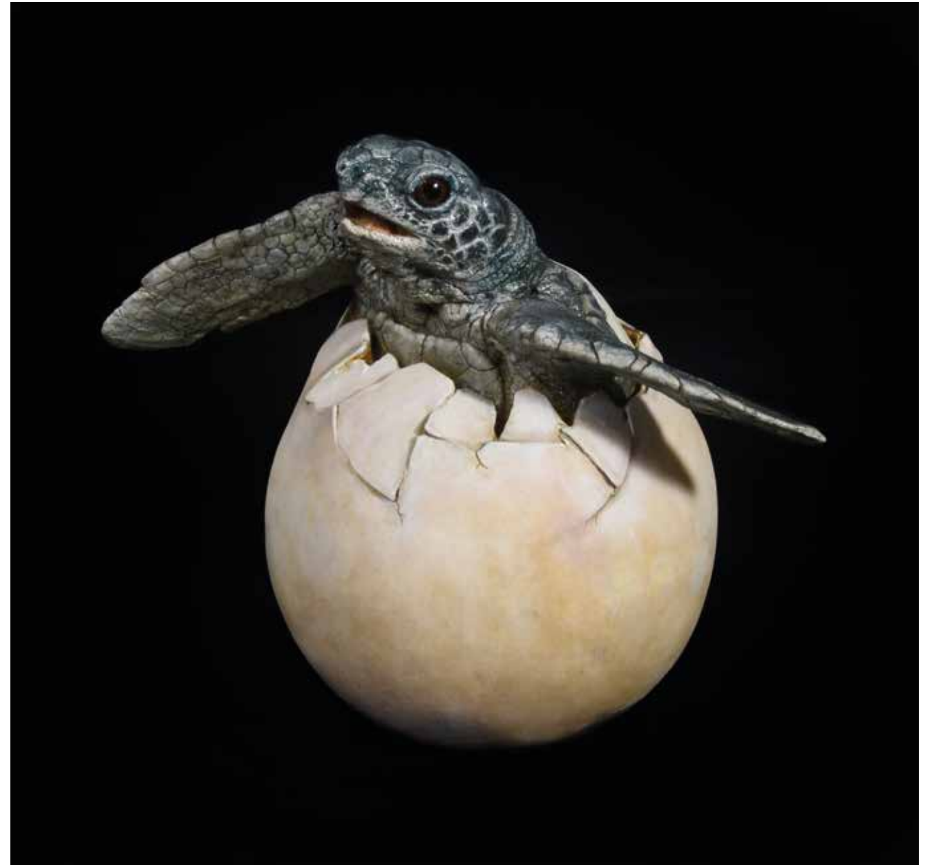
"LA GRANDE SCHIUSA" 2020 Sea Turtle hatching Oil painted Limited Edition 9 Various sizes h.9 Bronze fusion h.20 Bronze fusion h.40 cm Resina Apoxie