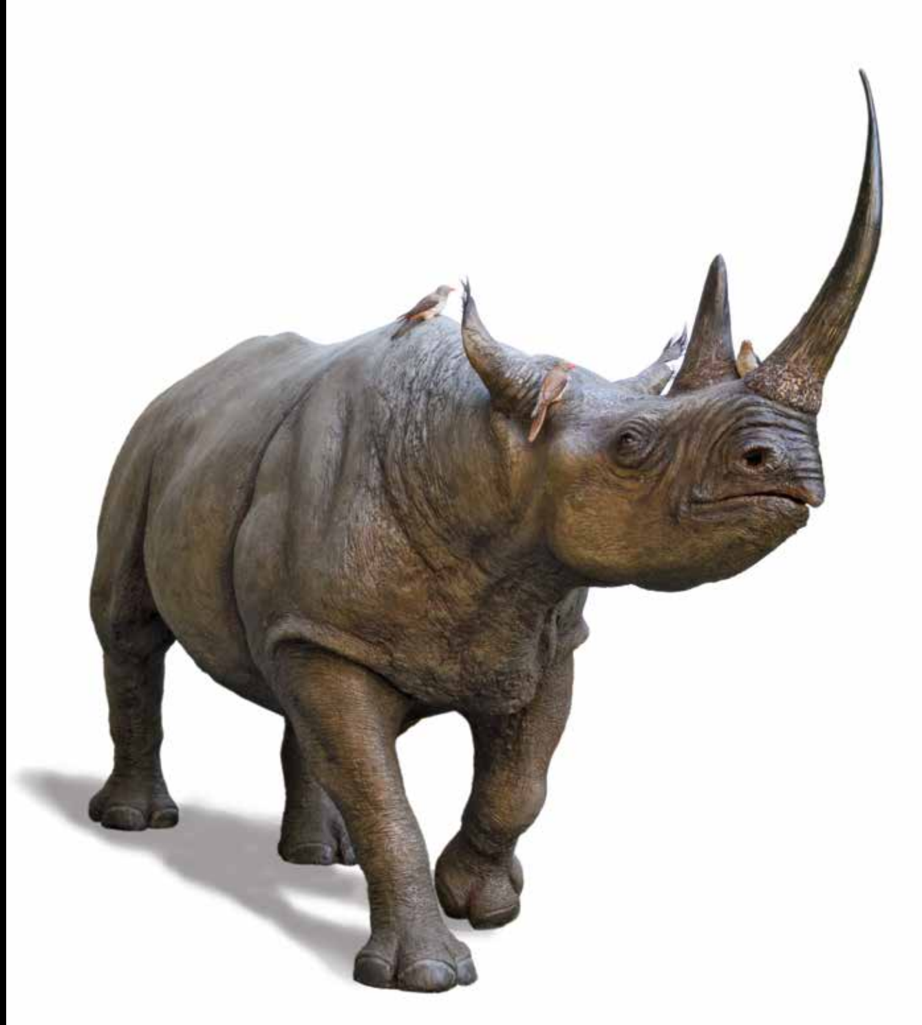
"COLOSSUS" 2020 Black rhino Mixed Media Acrylic painted Long. 350 cm.