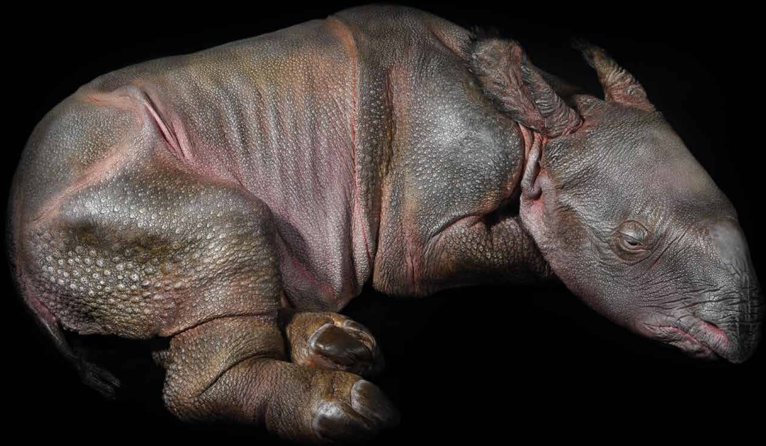
"IL PICCOLO GIACIGLIO" 2020 Indian rhinoceros cub Apoxie resin Oil painted Limited Edition 9 87x68 cm