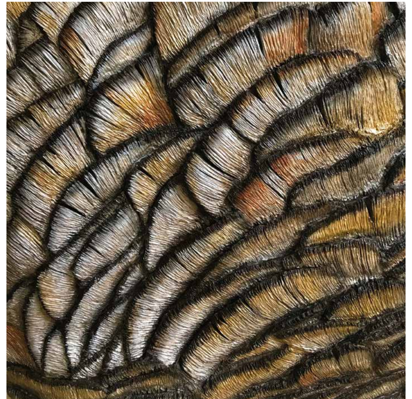
"MELEAGRIS GALLOPAVO" Secondary coverts feathers detail Wood pulp on table Oil painting Limited Edition 9 Diameter 120 cm