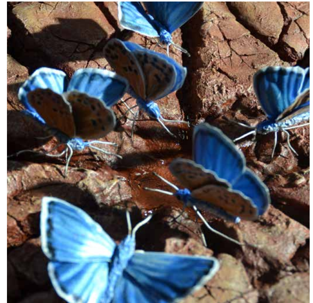
"THE LAST DROPS" Blues butterflies Copper and bronze on wood pulp Oil painting 32 x 30 x 12 cm