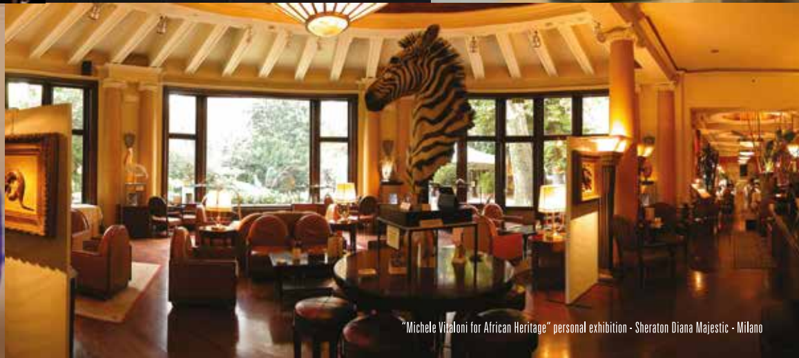
"Michele Vitaloni for African Heritage" personal exhibition - Sheraton Diana Majestic - Milano