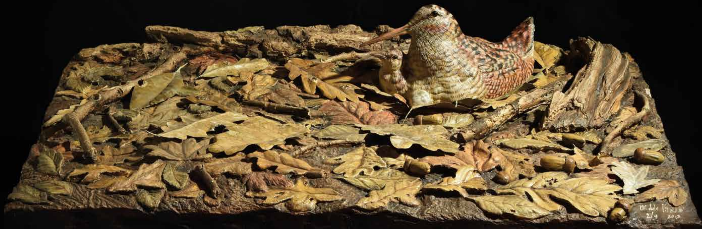
"LA REGINA DEL BOSCO" Woodcock on the nest Wood pulp, cantilevered copper Oil painted Original 80 x 100 cm