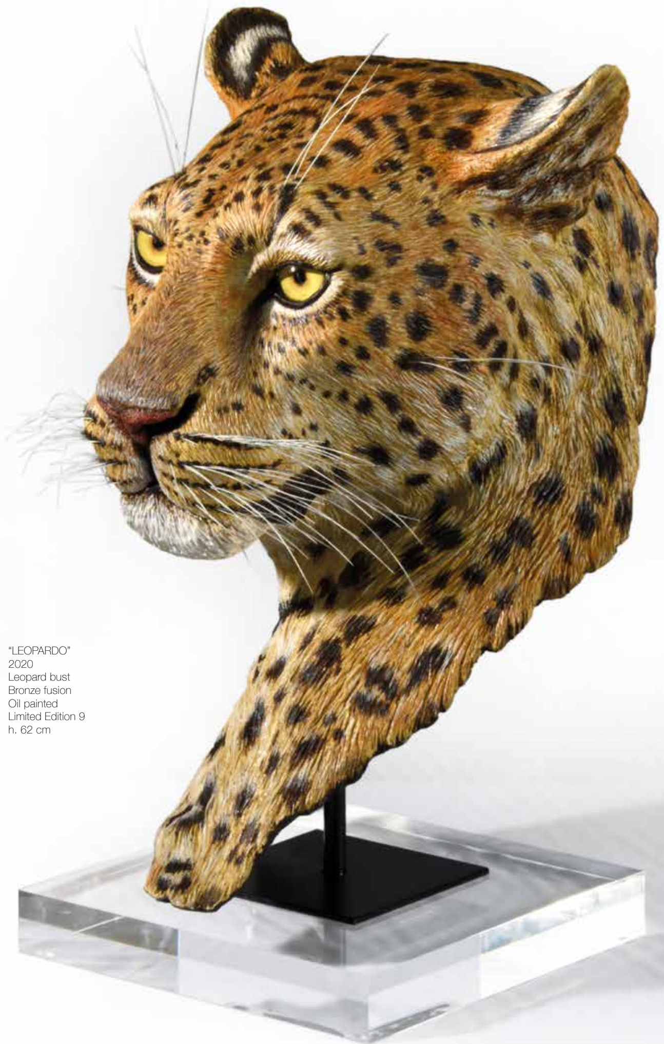
"LEOPARDO" 2020 Leopard bust Bronze fusion Oil painted Limited Edition 9 h. 62 cm