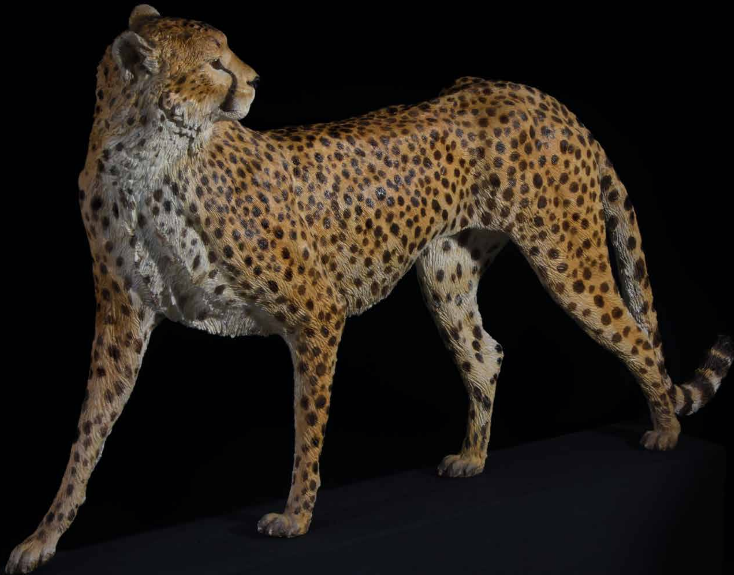
"LOOKING BACK" Cheetah Wood pulp Oil painted Limited Edition 9 h. 87x170x40 cm