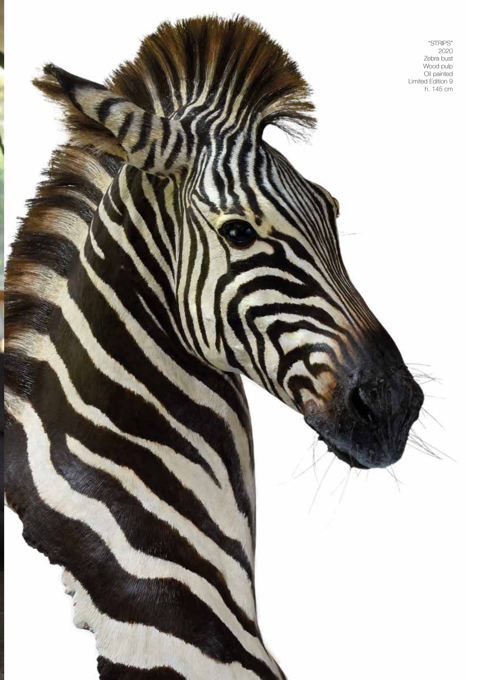
"STRIPS" 2020 Zebra bust Wood pulp Oil painted Limited Edition 9 h. 145 cm