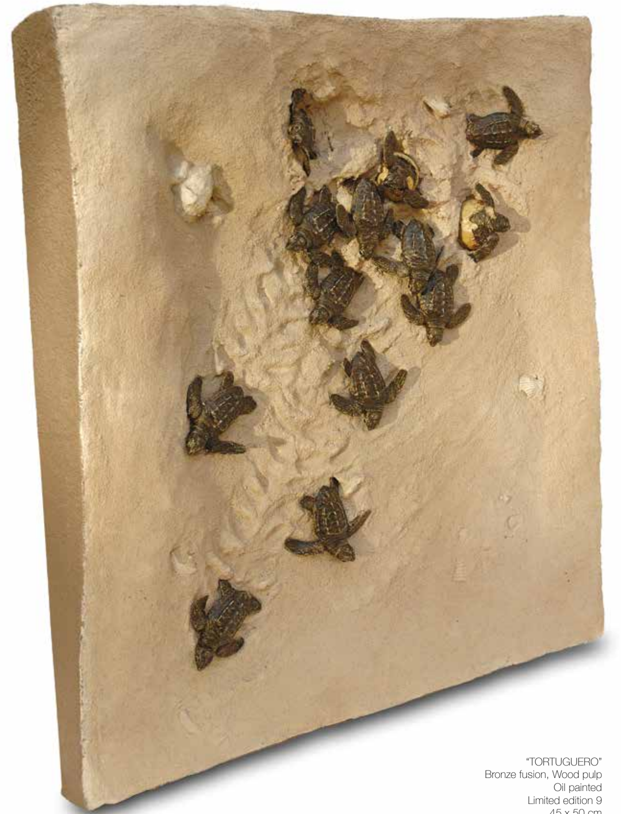
"TORTUGUERO" Bronze fusion, Wood pulp Oil painted Limited edition 9 45 x 50 cm