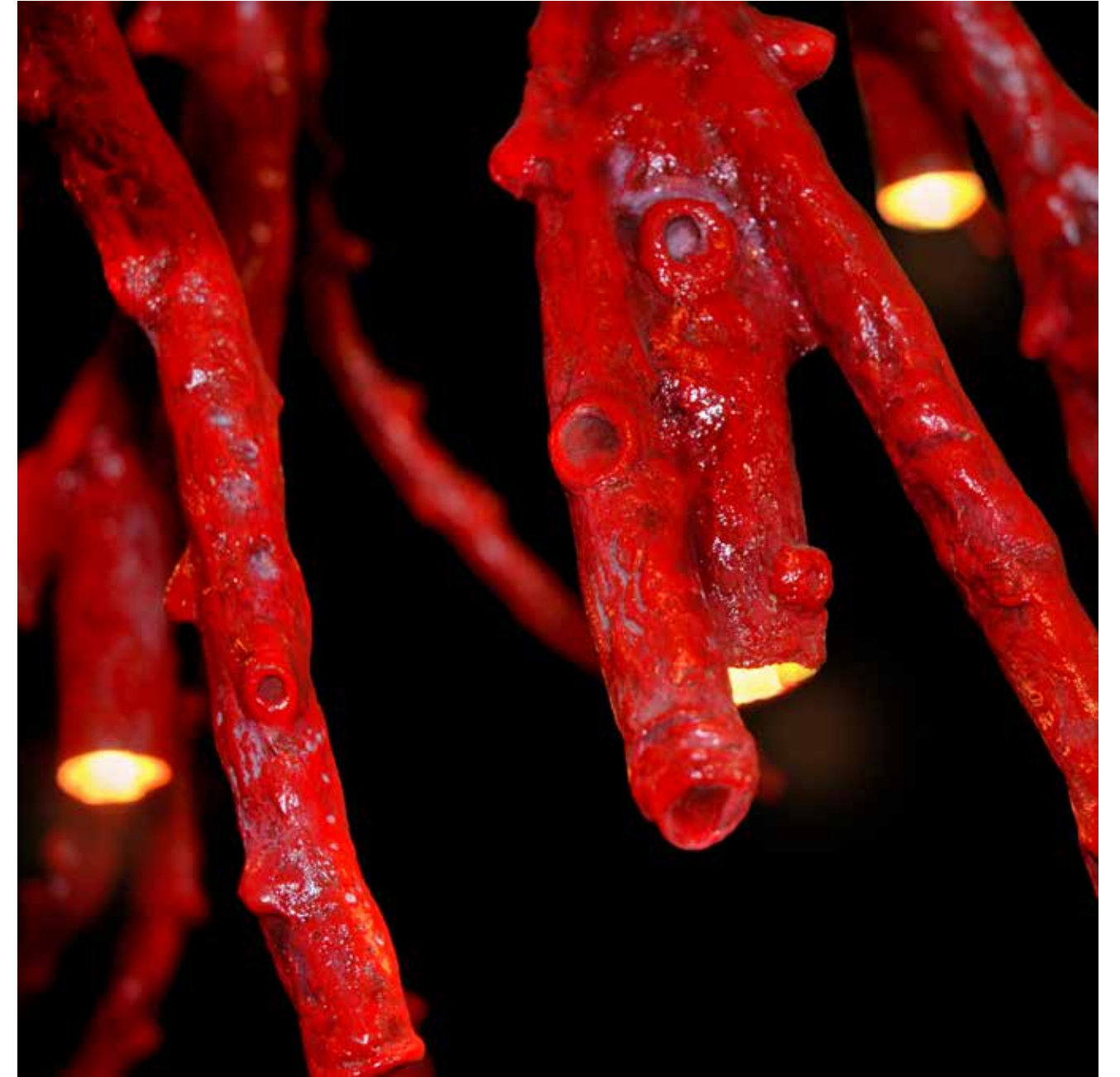
Red Coral chandelier, 2018 Copper and Wood pulp sculpture 8 led bulbs x 10 Oil painted on golden patina Original - UNIQUE ht. 59 cm long. 32 cm larg. 30 cm