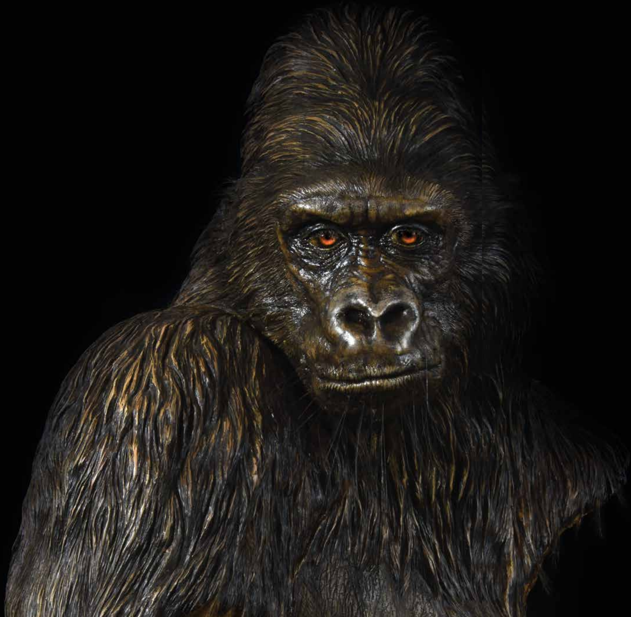
"GORILLA" Apoxie Resin Oil painted Limited Edition 9 h. 50 cm