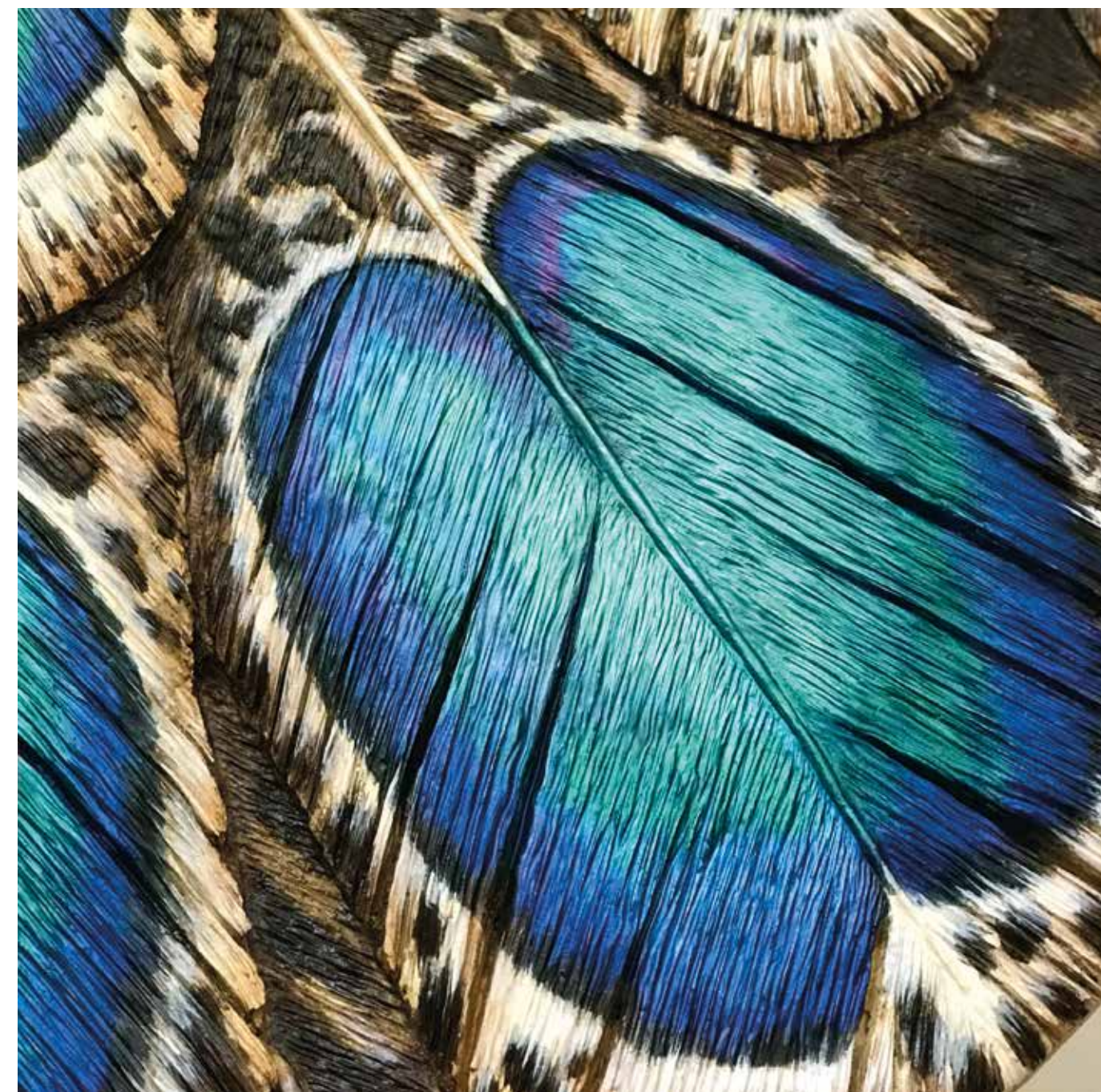
"POLYPLECTRON SCHLEIERMACHERI" Secondary reminges feathers detail Wood pulp on table Oil painting Limited Edition 9 Diameter 120cm