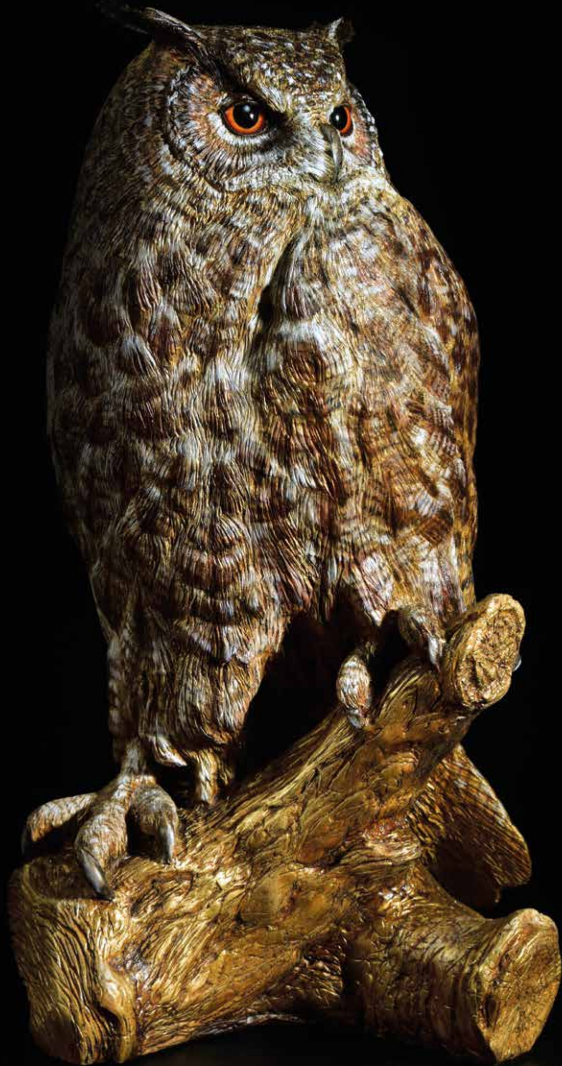
"IL SAGGIO" 2019 Eagle Owl Linden wood Oil painted Limited Edition 9 h. 62 cm