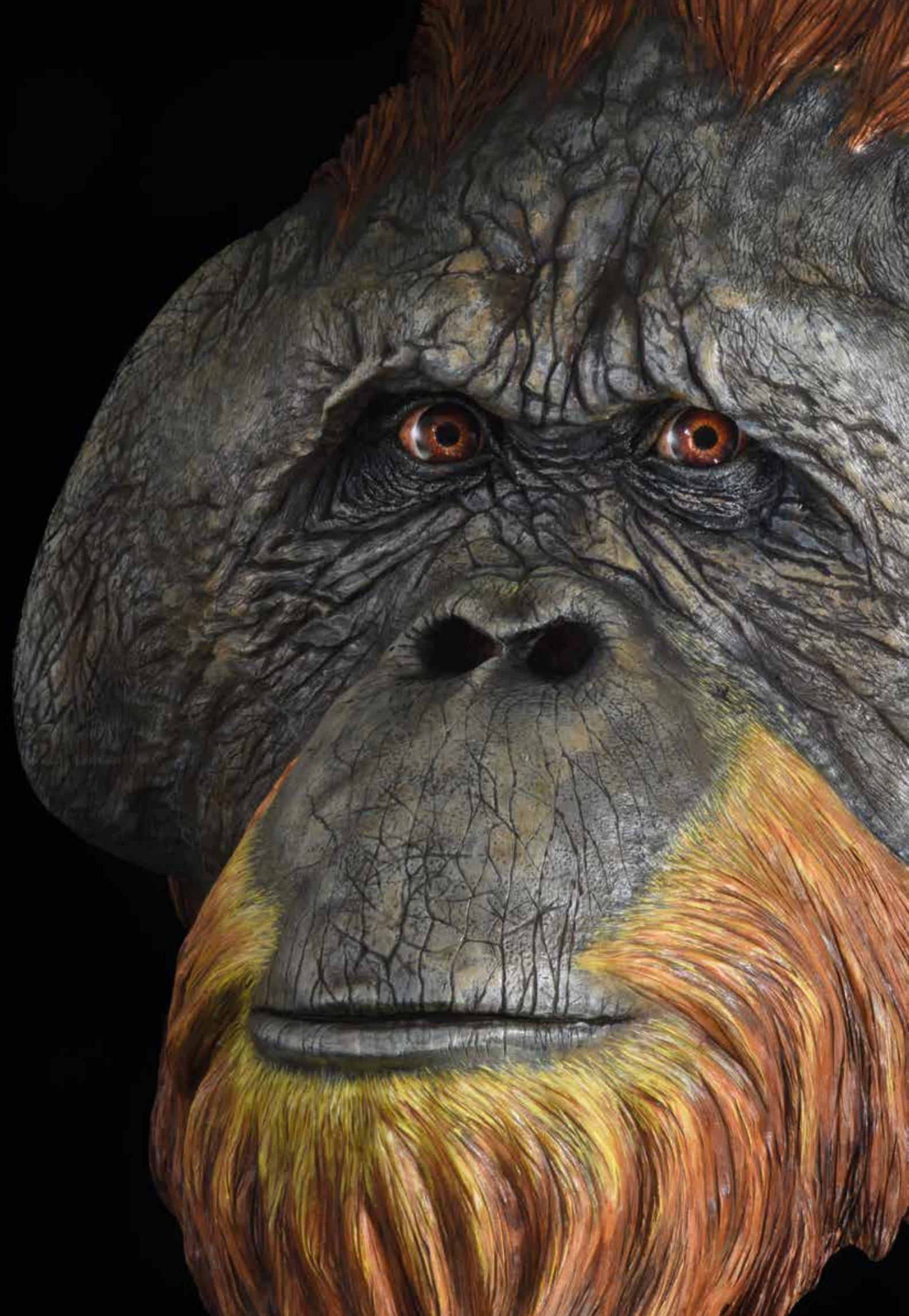
"IL PENSATORE" 2020 Orangutan Wood Oil painted Limited Edition 9 h. 120 cm