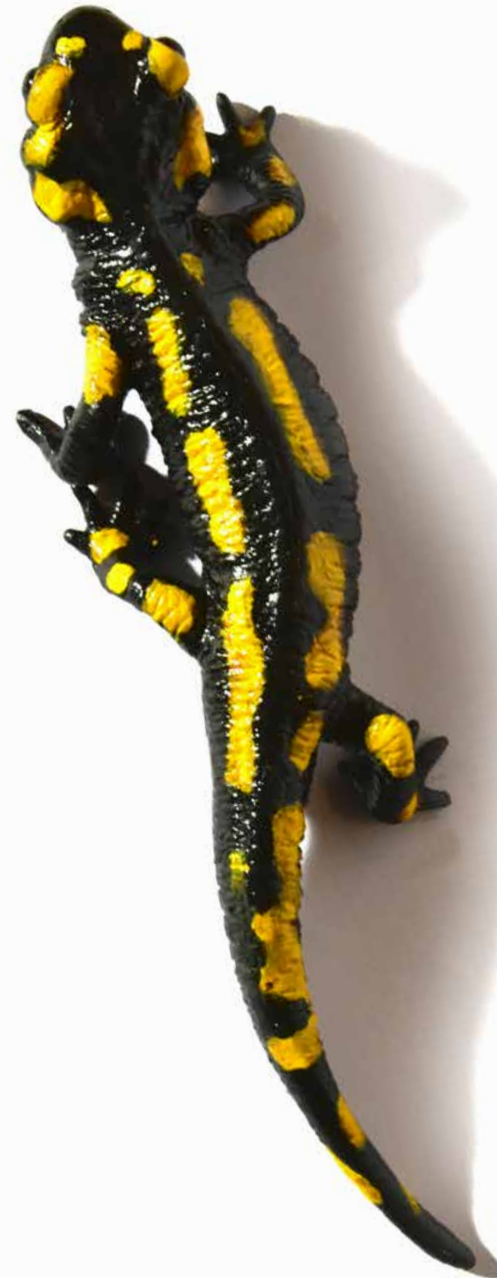
"A PICCOLI PASSI" Bronze fusion Oil painted Limited edition 9 long. 19 cm