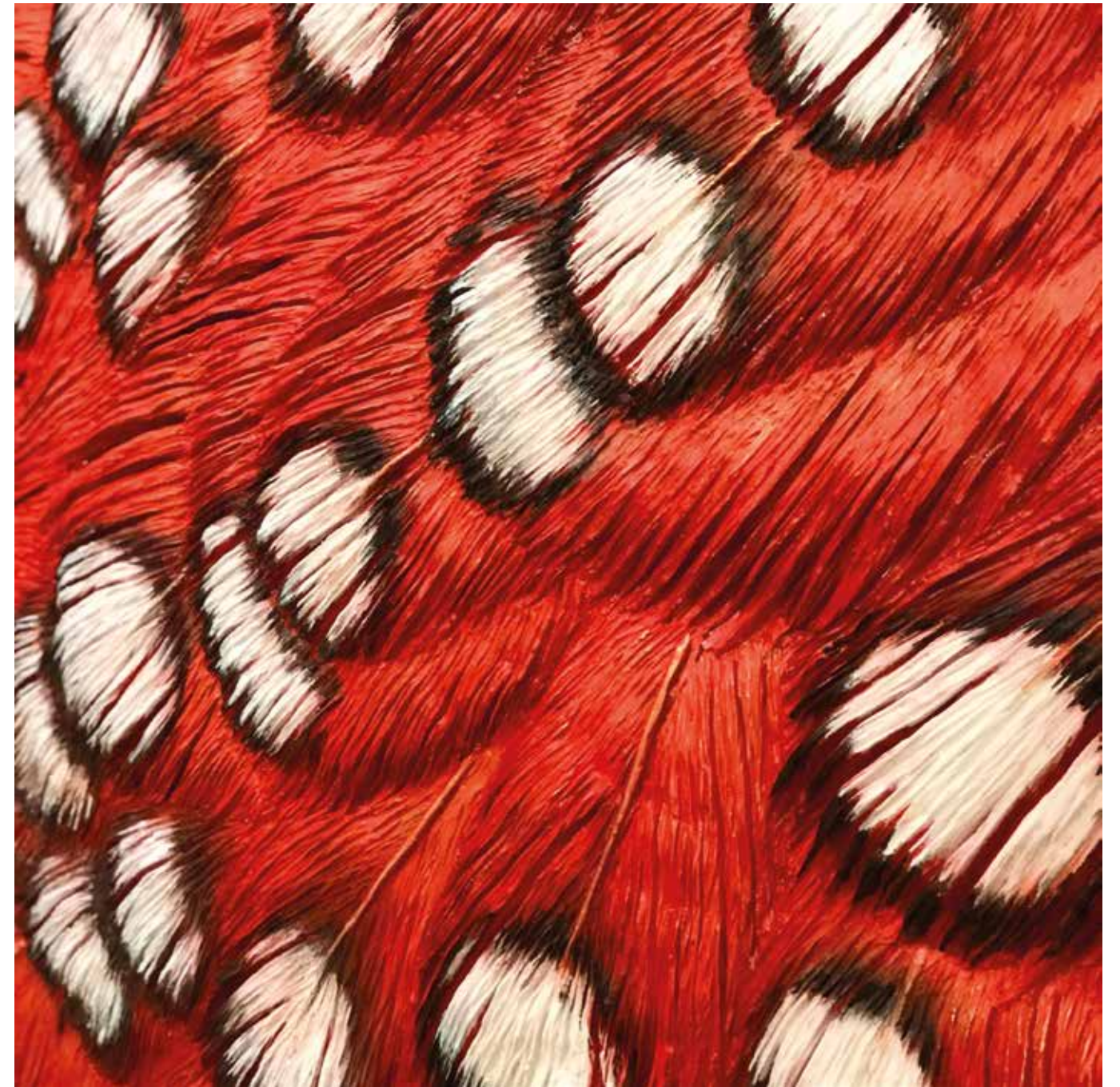
"TRAGOPAN SATYRA" Pectoral feathers detail Wood pulp on table Oil painting Limited Edition 9 Diameter 120cm