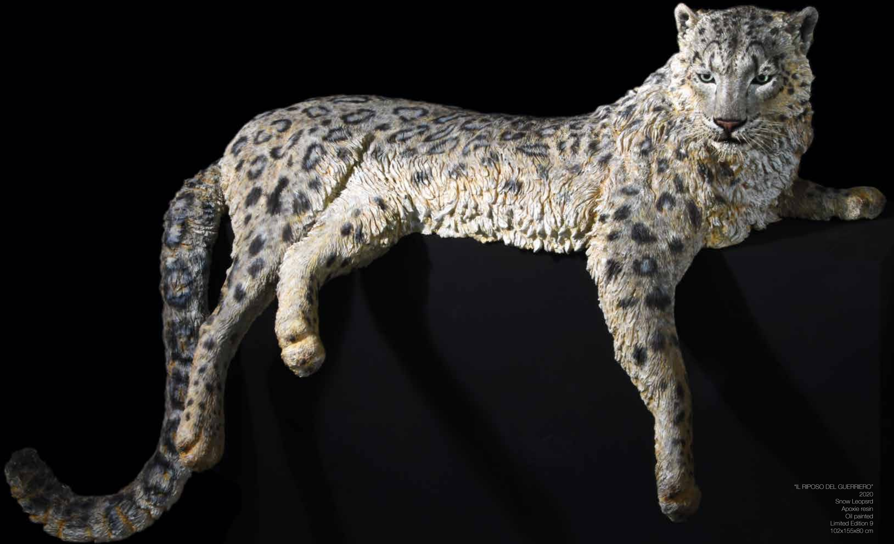
"IL RIPOSO DEL GUERRIERO" 2020 Snow Leopard Apoxie resin Oil painted Limited Edition 9 102x155x80 cm