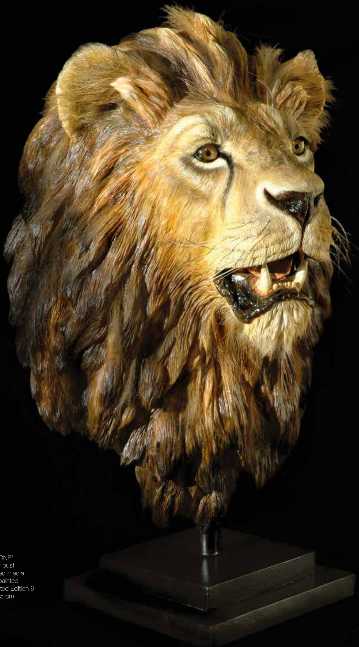
"LEONE" Lion bust Mixed media Oil painted Limited Edition 9 h. 85 cm