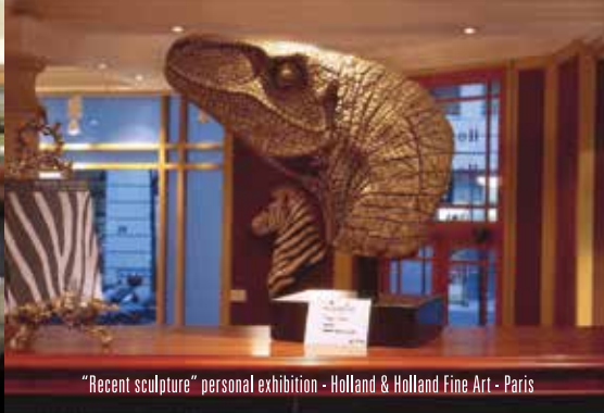
"Recent sculpture" personal exhibition - Holland & Holland Fine Art - Paris