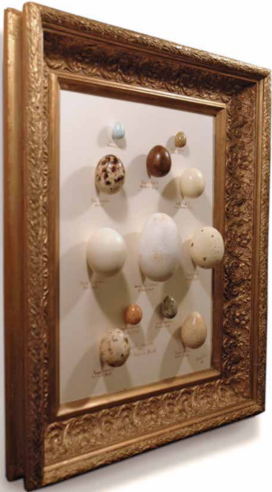
"COLLEZIONE OVALIA RAPACI AMERICANI" American birds eggs Linden wood Oil painted antique Italian frame 19 o Century Original 65 X 55 cm