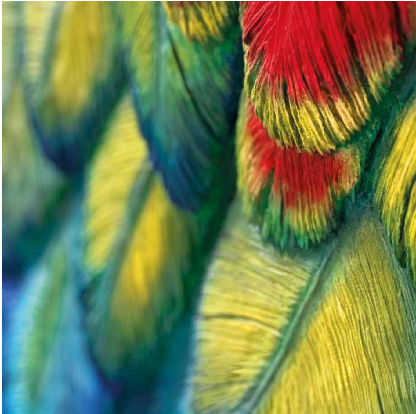
"ARA MACAO" Scapulars and tertials flight feathers detail Wood pulp on table Oil painting Limited Edition 9 Diameter 120cm