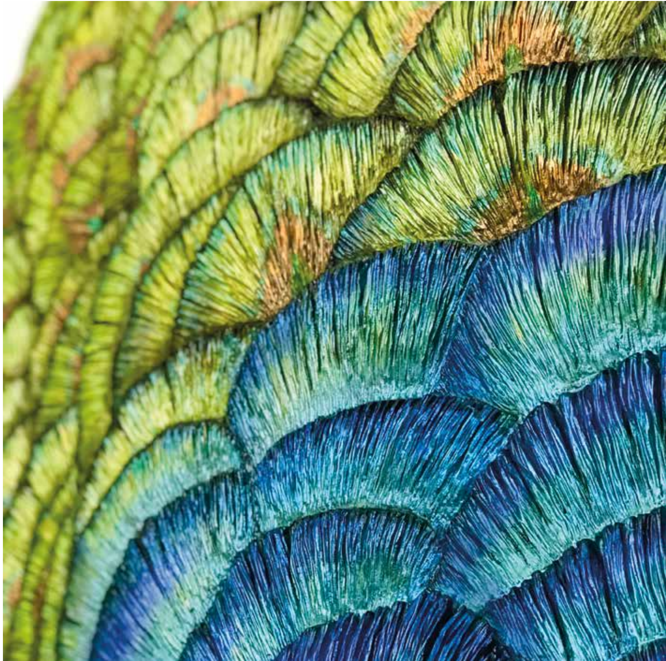
"PAVO CRISTATUS" Rump feathers detail Wood pulp on table Oil painting Limited Edition 9 Diameter 120cm