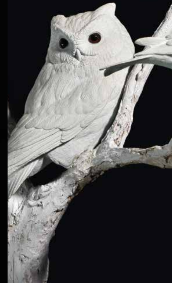
"ALBERO DELLA VITA" Bronze fusion, Iron and Wood pulp Oil painted Original 140 x 160 cm