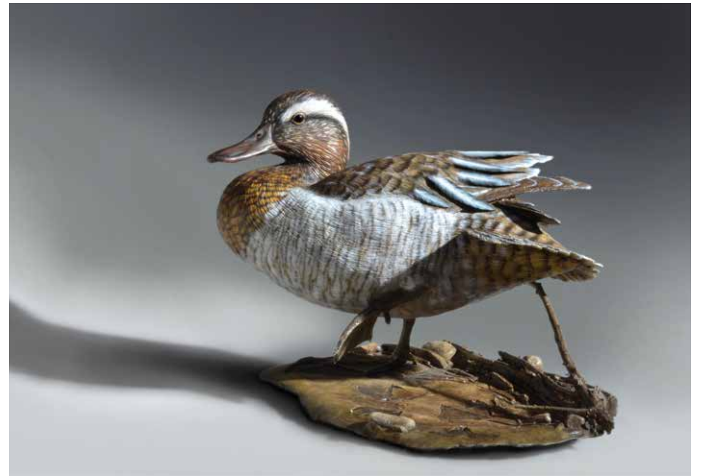
"MARZAIOLA" Garganey Bronze fusion Oil Painted Limited edition 9 32 x 23 cm