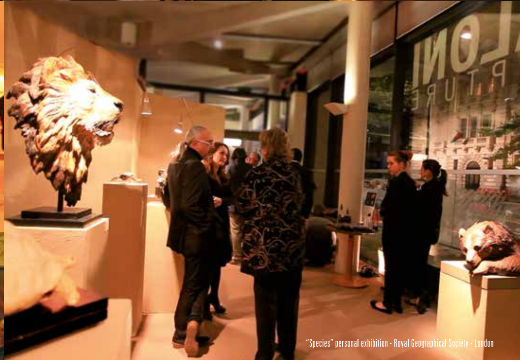
"Species" personal exhibition - Royal Geographical Society - London