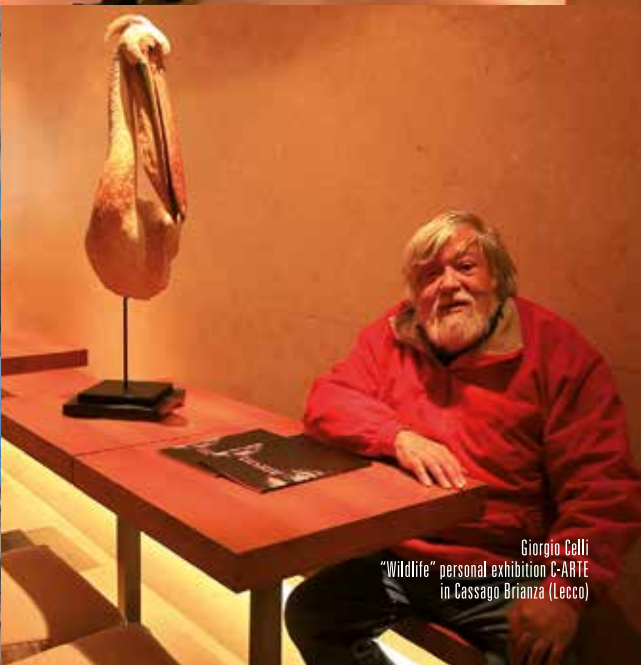
Giorgio Calli "Wildlife" personal exhibition C-ARTE in Cassago Brianza (Lecco)

22 April - 4 June 2012 : Personal Exhibition - Barclays Wealth Bank - Montecarlo. 27-28 April 2012: Collective Exhibition - Villa Litta - Lainate - Milan. 20 May - 20 September 2012: "Summer Exhibition" - Collective Exhibition - Rarity Gallery, Mikonos - Grece