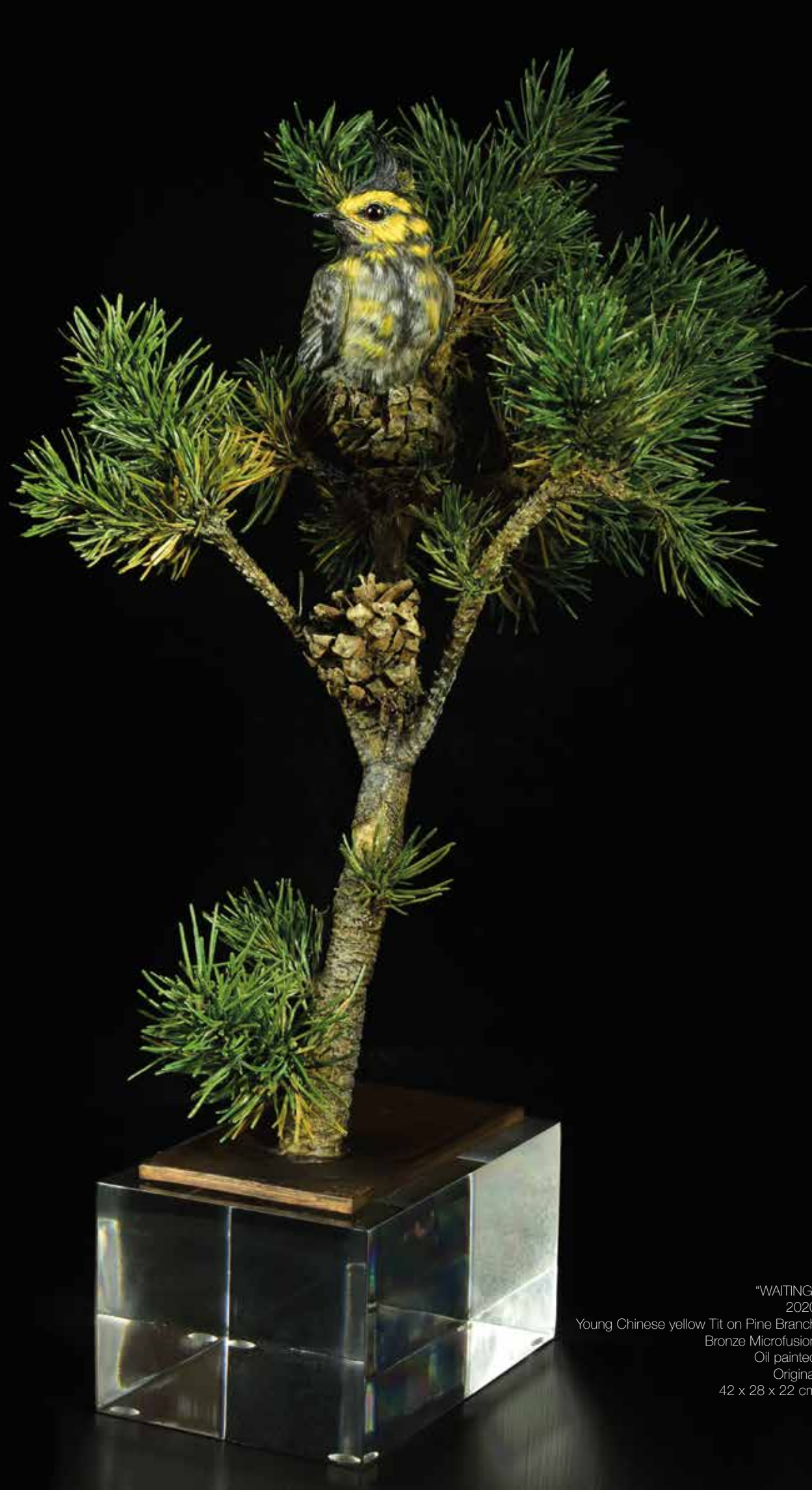
"WAITING" 2020 Young Chinese yellow Tit on Pine Branch Bronze Microfusion Oil painted Original 42 x 28 x 22 cm