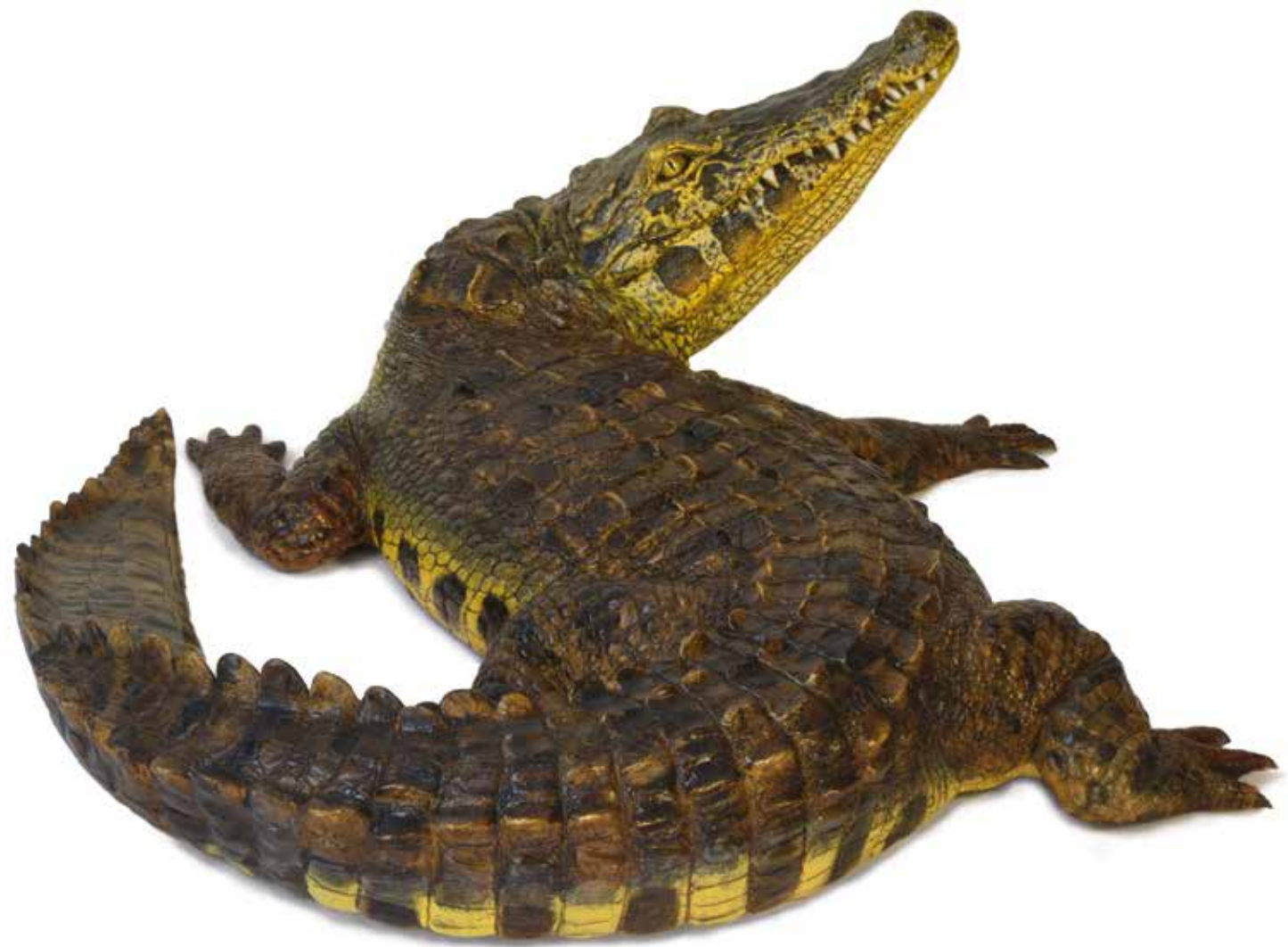
"JACARÉ" Crocodile 2020 Wood pulp Oil painted Limited edition 9 73 X 70 cm