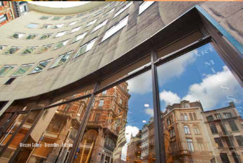
Miessen Gallery - Bruxelles - Belgium