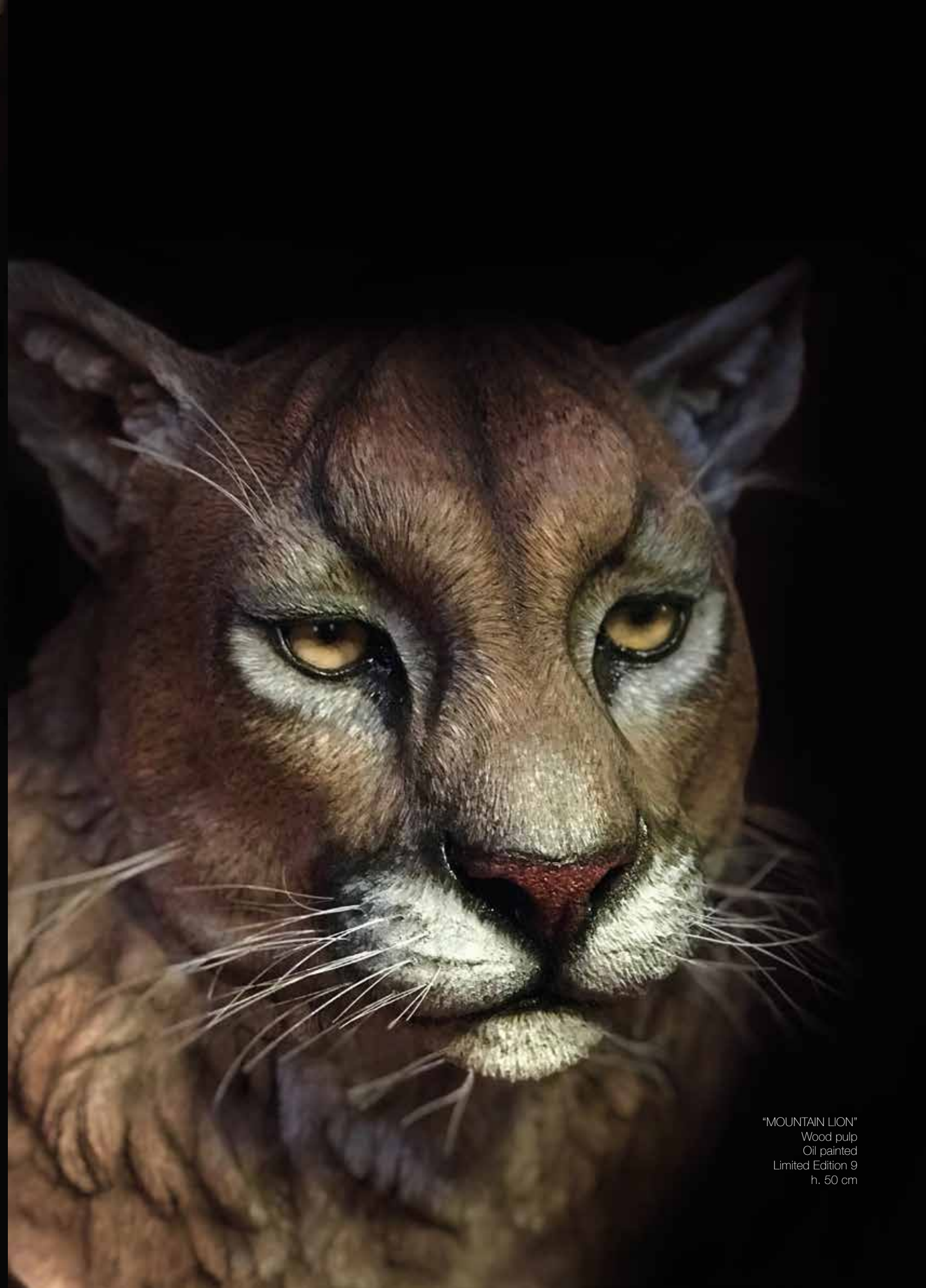
"MOUNTAIN LION" Wood pulp Oil painted Limited Edition 9 h. 50 cm