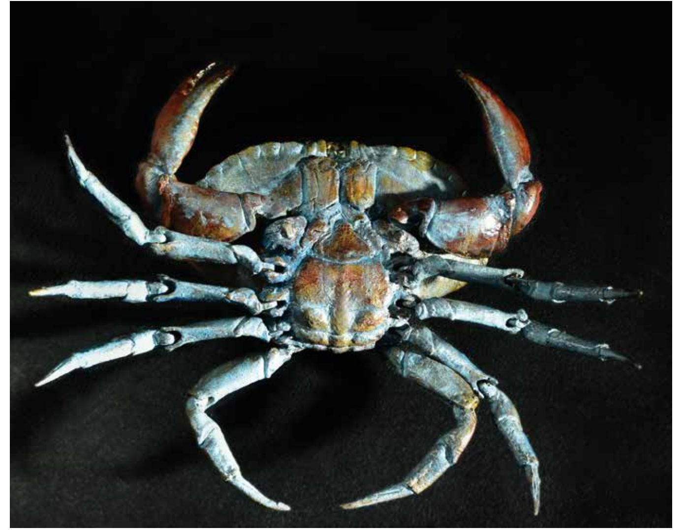
"GRANCHIO" 2020 Bronze fusion articulated Oil painted Limited edition 9 long. 35 cm