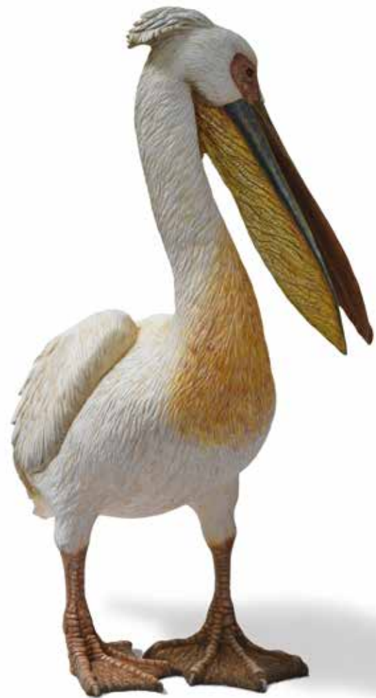
"RE PESCATORE" Pelican Linden wood Oil painted Original 97 x 60 x 40 cm