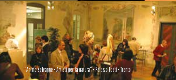
"Anime sauvage - Artisti per la natura" - Palazzo Festi - Trento