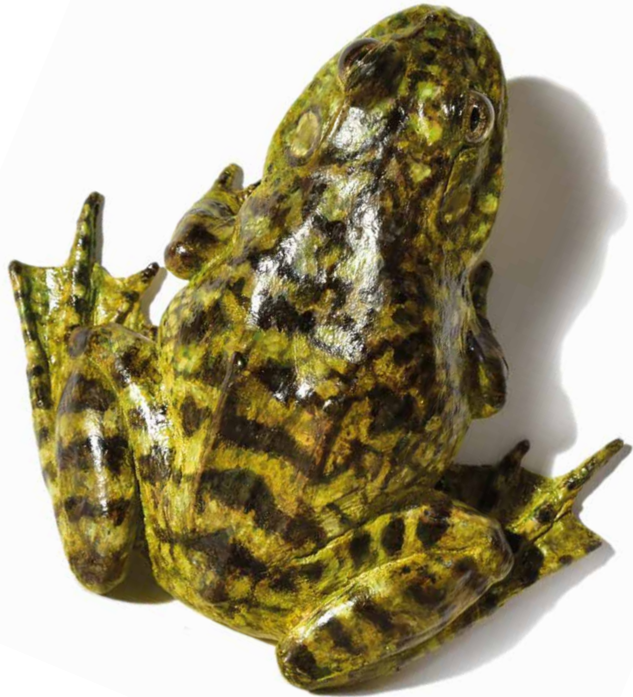
"RANA TORO" Bronze fusion Oil painted Limited edition 9 long. 14 cm