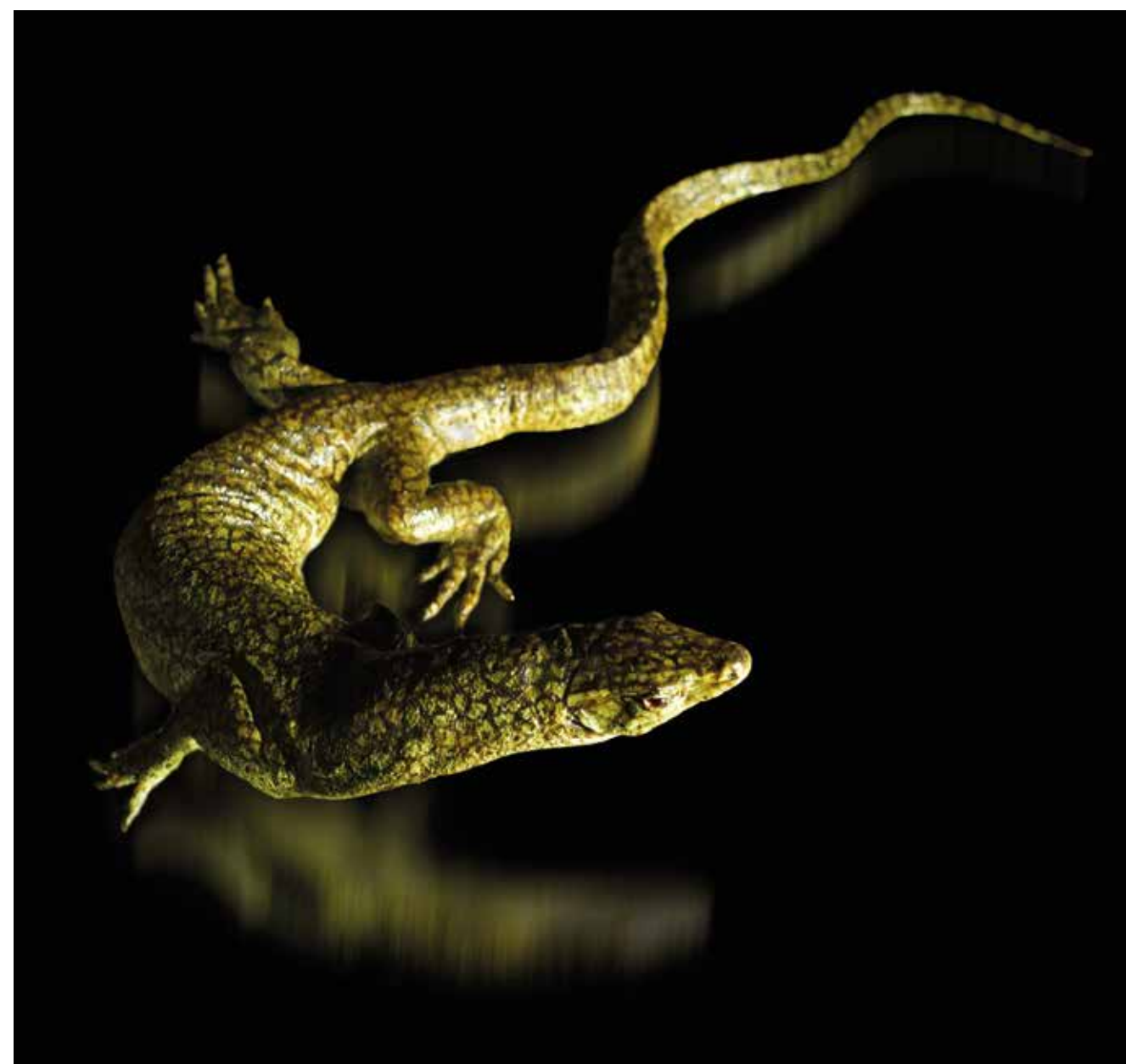
"RAMARRO" Bronze fusion Oil painted Limited edition 9 long. 42 cm