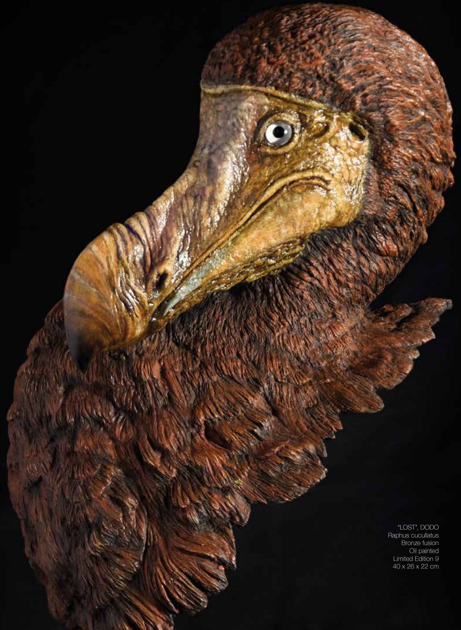
"LOST", DODO Raphus cucullatus Bronze fusion Oil painted Limited Edition 9 40 x 26 x 22 cm