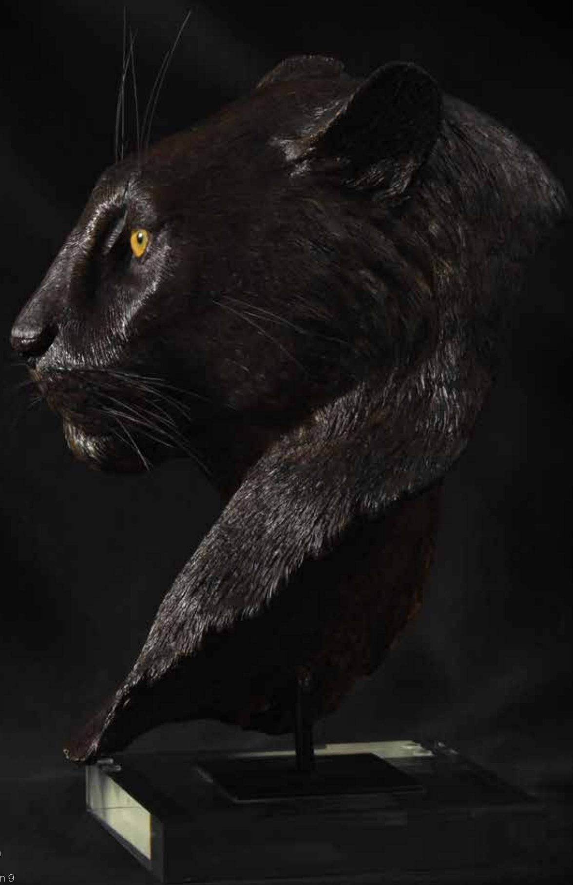
"BAGHERA" 2020 Panther bust Bronze fusion Oil painted Limited Edition 9 h. 62 cm