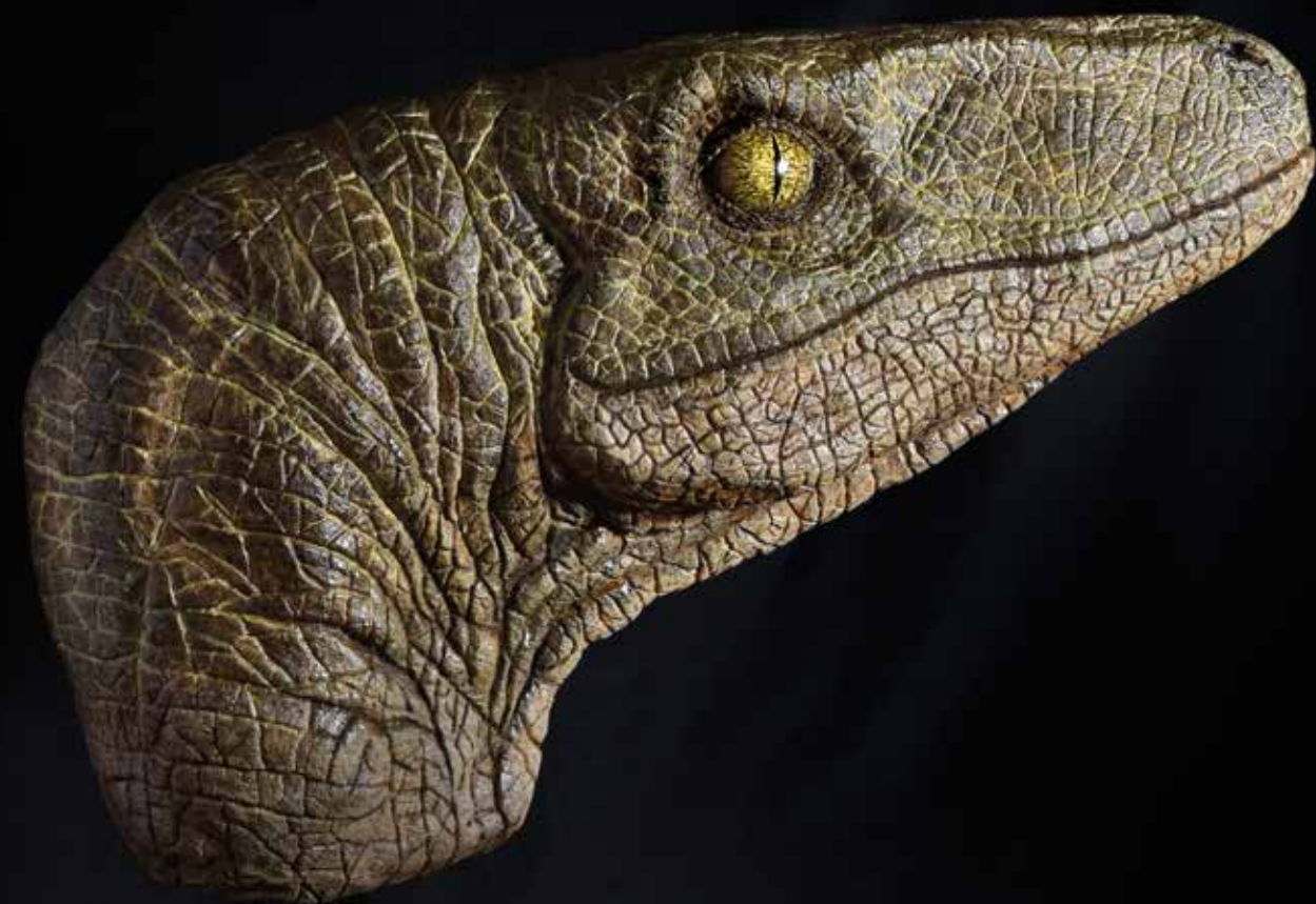
"RAPTOR" 2021 Wood Oil painted Limited Edition 9 h. 120 cm 65 x 78 x 23 cm