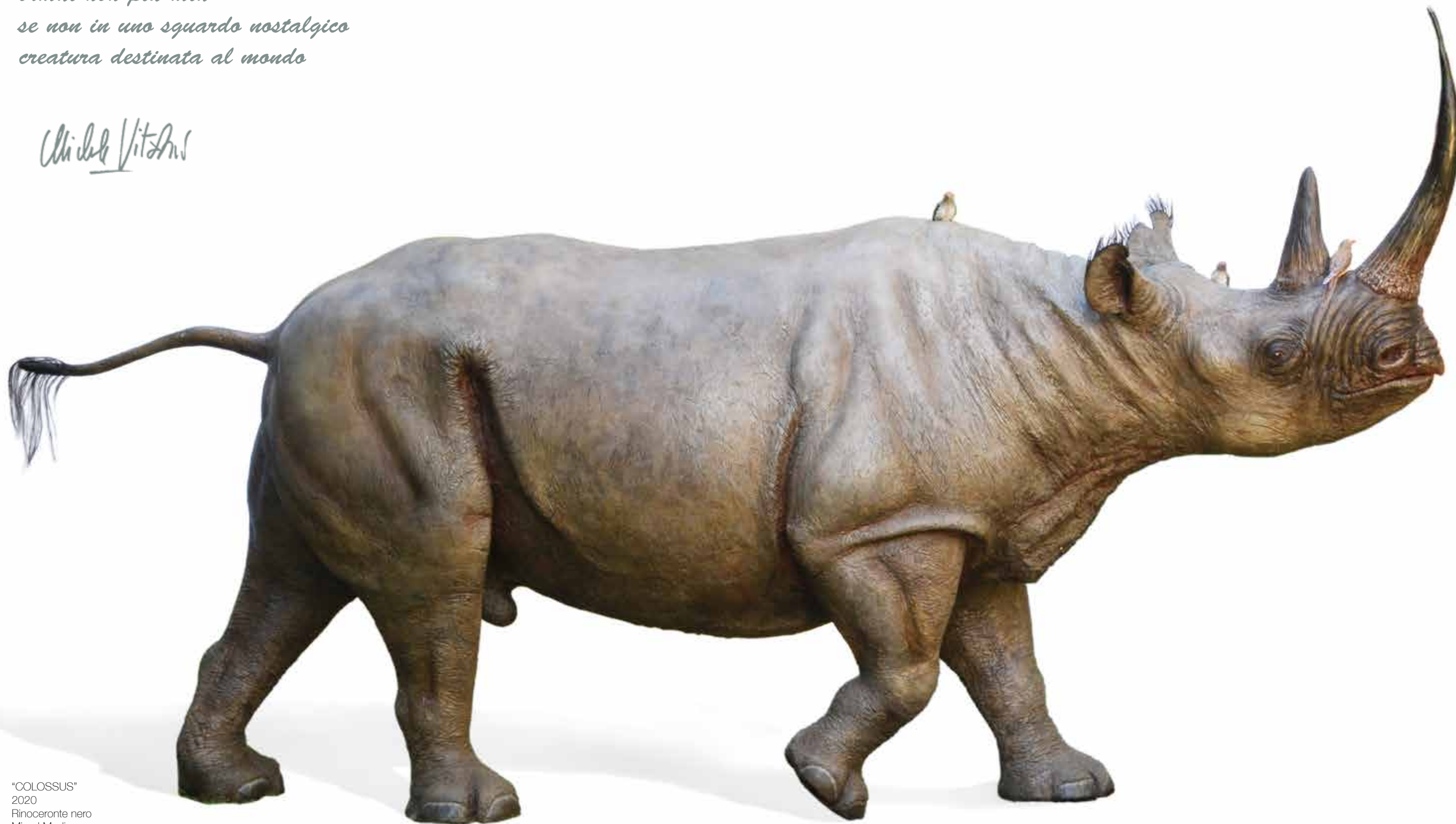
"COLOSSUS" 2020 Rinoceronte nero Mixed Media Dipinto ad acrilico Lung. 350 cm.